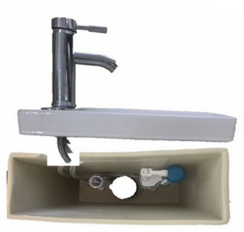
6. Water pipe connection fittings