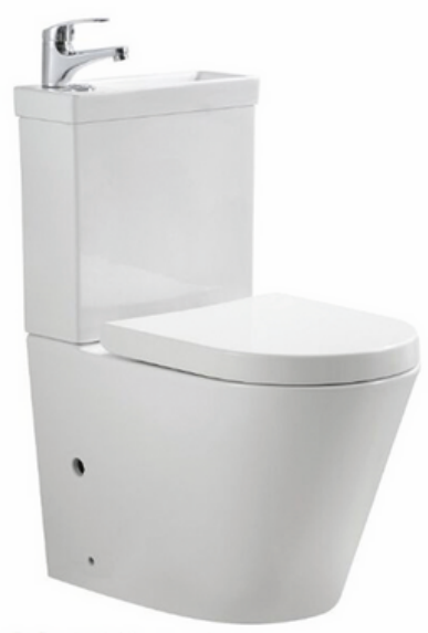
8. Install the seat cover