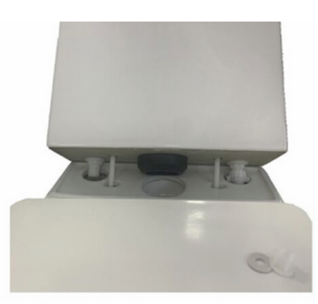
7. Put it on the toilet bowl and lock the screw