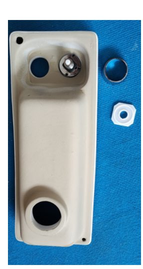
then reassemble them with the lavatory panel.